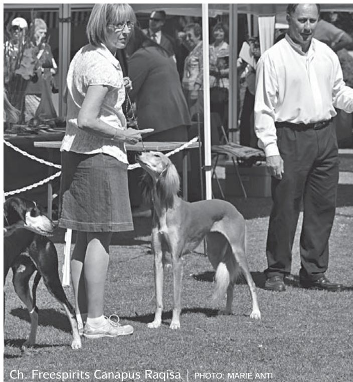
Ch. Freespirits Canapus Raqisa