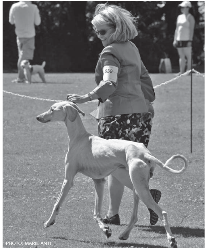
Winners Dog Dadaelis Kushiels Scion Of T'Cai