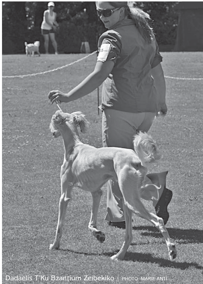
Dadaelis T'Ku Bzantium Zeibekiko

Nice black-and-silver puppy with lots of spring and ground coverage in his gate. Well-balanced conformation and adequate shoulder layback. I would like to see more upper arm and turn of stifle.