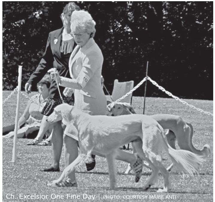
Ch. Excelsior One Fine Day