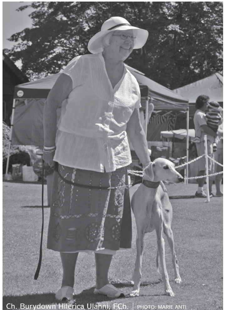
Ch. Burydown Hilerica Ulahni, FCh.