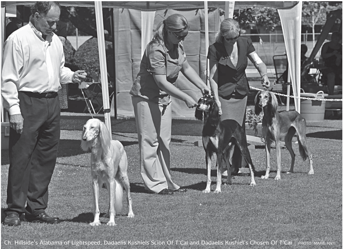
Ch. Hillside's Alabama of Lightspeed, Dadaelis Kushiels Scion Of T'Cai and Dadaelis Kushiels Chosen Of T'Cai