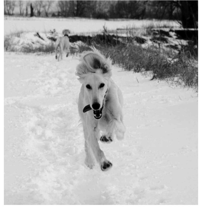
Spring 2008 SALUKIsightings

Unbridled enthusiasm is evidenced by this fellow's wolfish grin as he bounds through the air. His coal-black eyes and mouth and the bank of trees in the background are in counterpoint to the field of snow. The dog's head-on approach, paws in the air, and a vertical trail of golden brambles lend an immediate sense of movement to the vista.