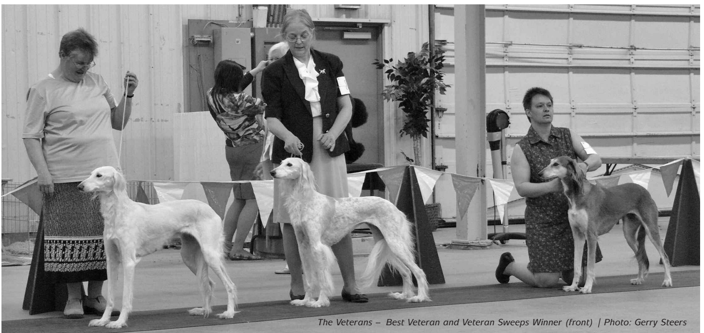
The Veterans – Best Veteran and Veteran Sweeps Winner (front) | Photo: Gerry Steers