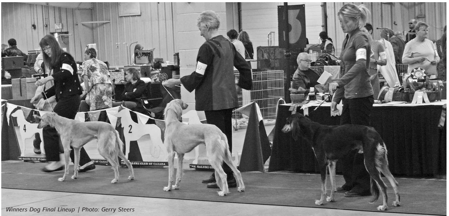
Winners Dog Final Lineup

Black and tan smooth. At first glance, this bitch gave me goosebumps. She was of such high quality – good eyes and head shape, strong neck and topline, good croup and tail set and nice moderate hindquarters. She lacked a little underjaw and, unfortunately, her movement left a lot to be desired.