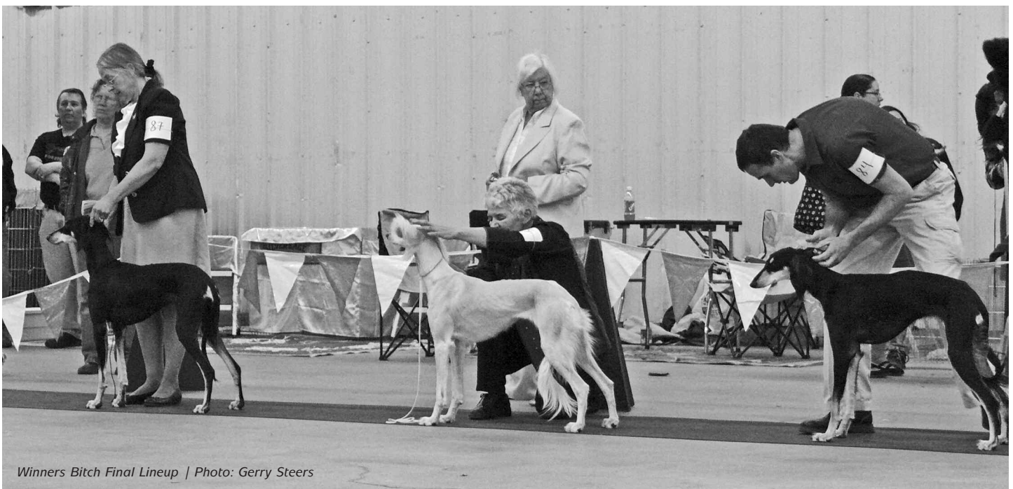
Winners Bitch Final Lineup