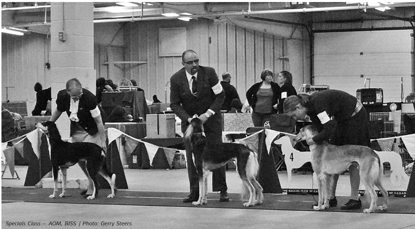
Specials Class – AOM, BISS

Tricolour. A very balanced bitch, with a good forechest,