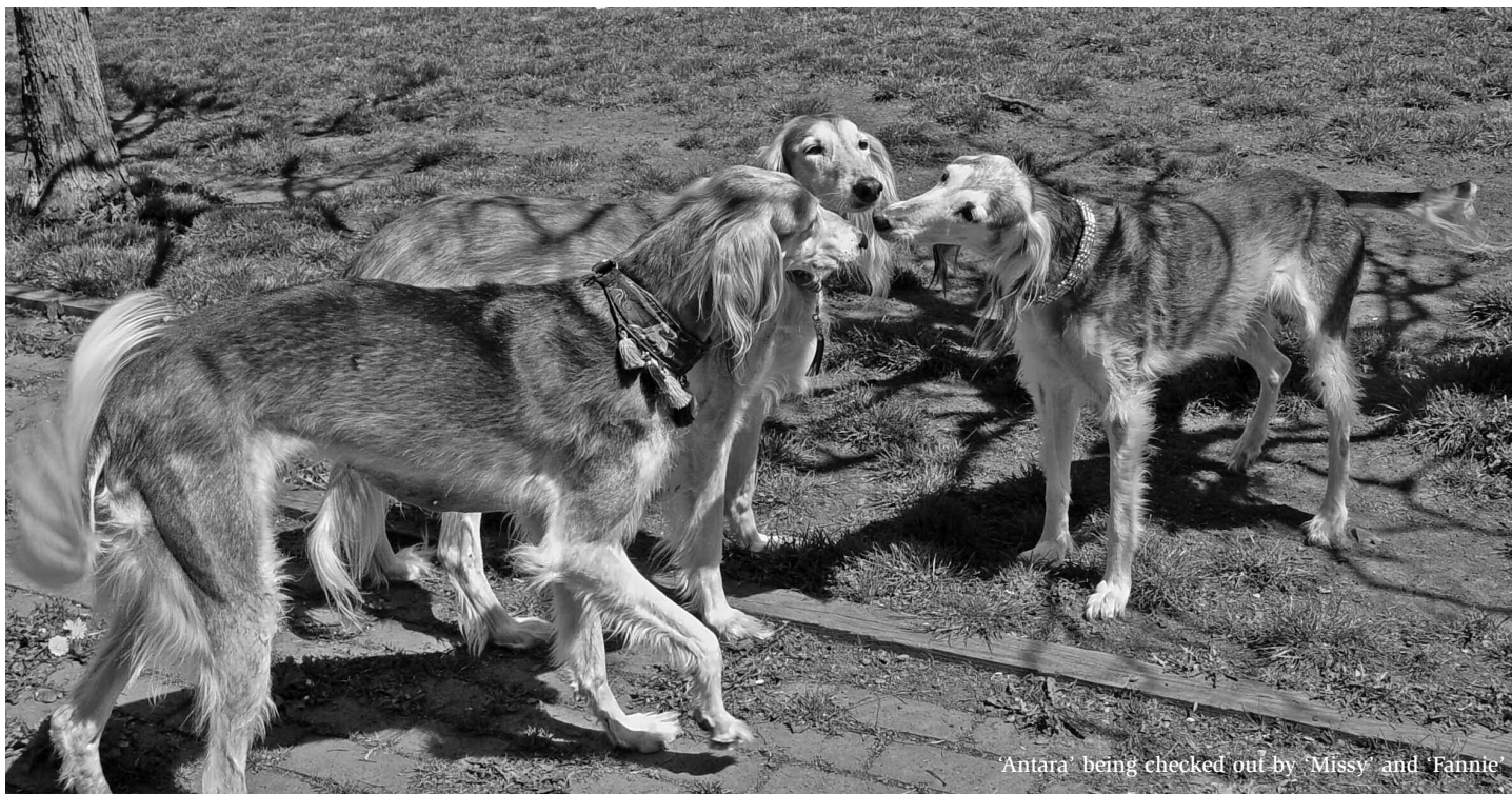
'Antara' being checked out by 'Missy' and 'Fannie'