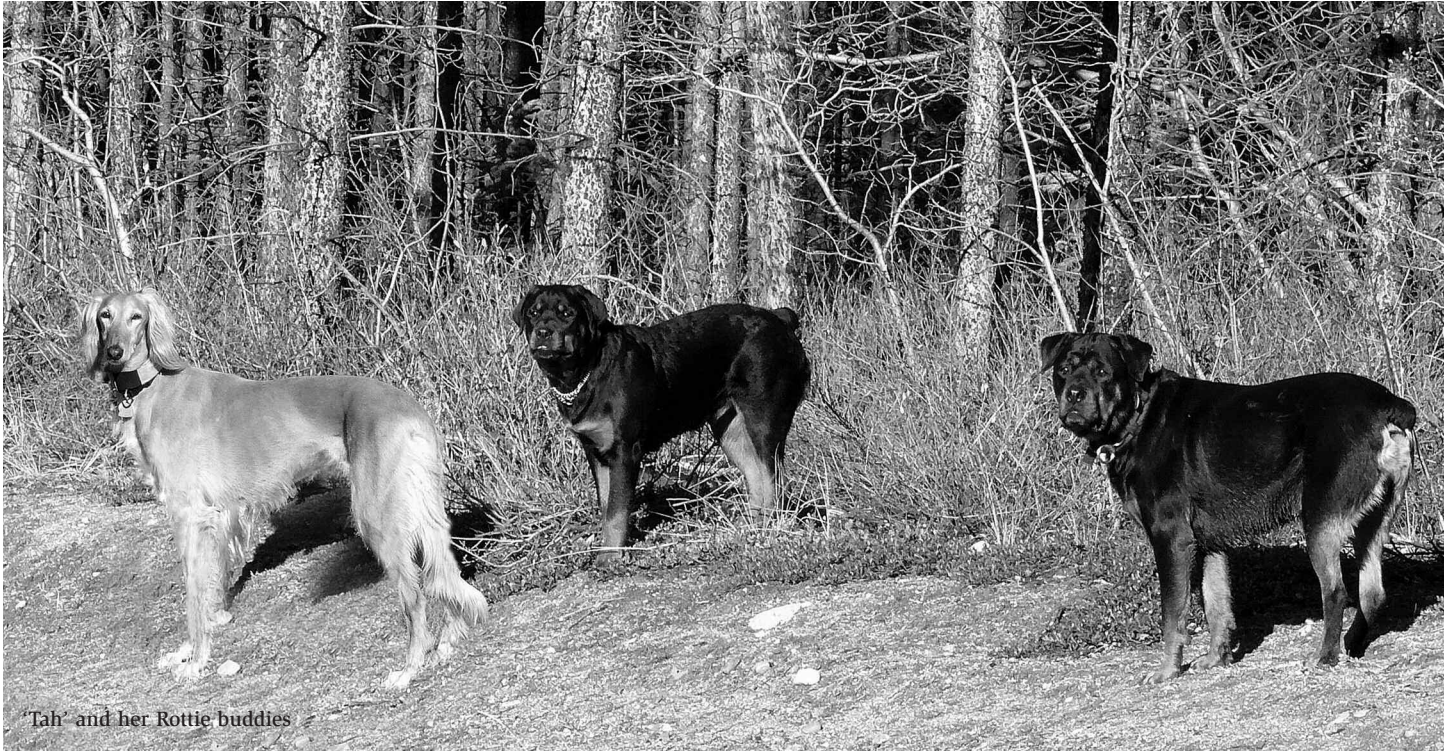
'Tah' and her Rottie buddies