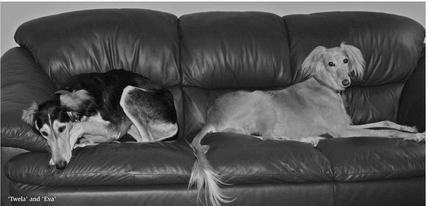
'Twela' and 'Eva'

Twela (the grizzle) has been with us four months. She is pictured here looking rather sheepish because she just finished eating the TV remote! She is accompanied by 'Eva,' who also came to us through STOLA and has been with us for a year. (Please see the BC report in 'Across Canada' for more on the rescue of Twela.)